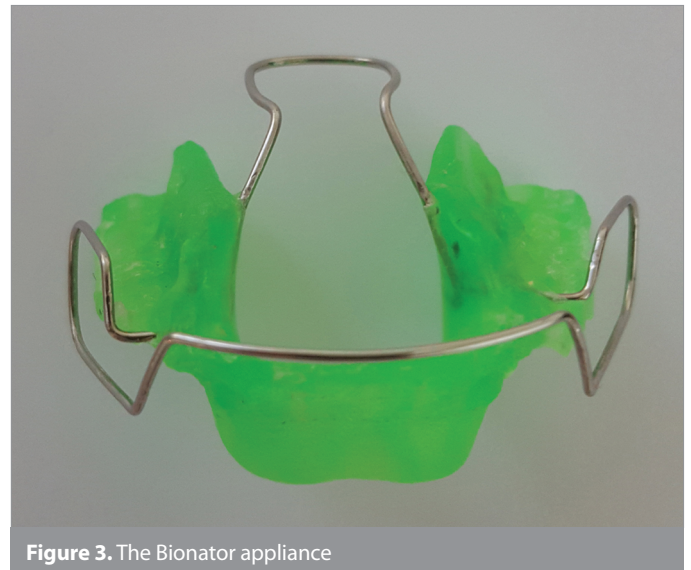
Figure 3. The Bionator appliance