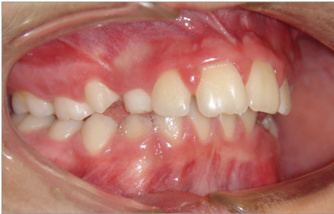
Figure 4. Pre-treatment image of a patient with mandibular deficiency