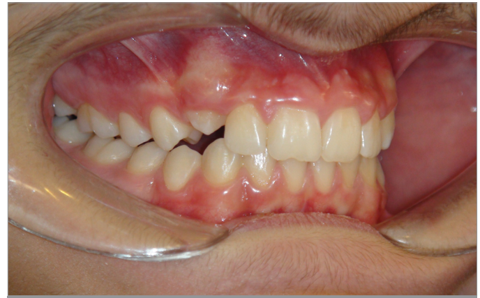
Figure 5. Post-treatment image of the same patient with Farmand appliance

patients were focusing at a long distant spot at eye level. The linear and angular cephalometric measurements were used for comparison of the treatment effects between the two groups. These measurements were as follows: